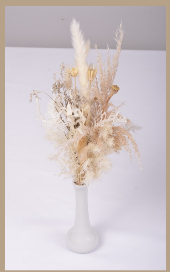
Mini Spray Little upright floral bunches suitable for a budvase. (not recommended for outdoor purposes)