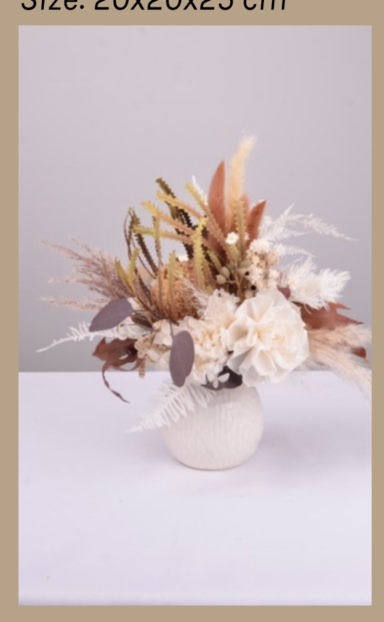
Petite Posy Size: 20x20x25 cm

Small Flower bunch, that is great for ceremony and reception. various vase options.