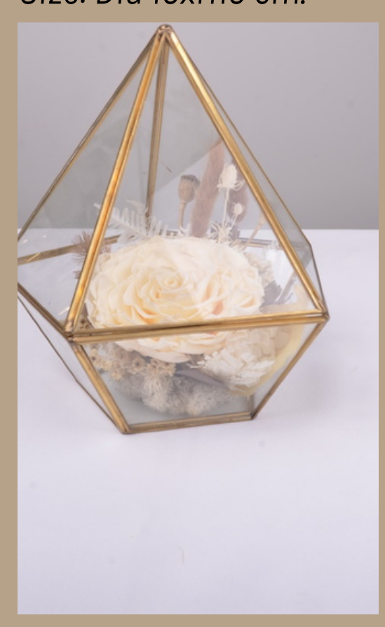
Small Terrarium Size: Dia 16xH19 cm.

Small arrangement sitting within an enclosed gold/glass terrarium